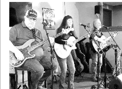
The Killah B's