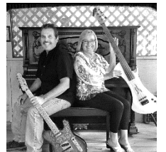
Hot Damn Duo